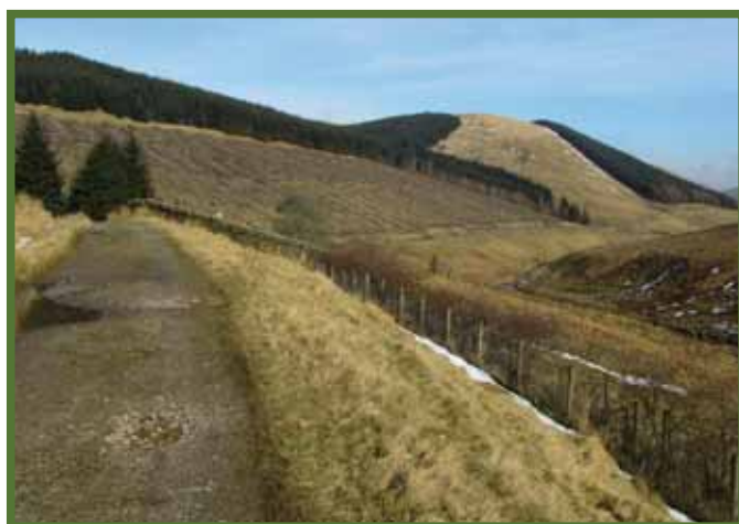
Track heading back to Potburn and start point