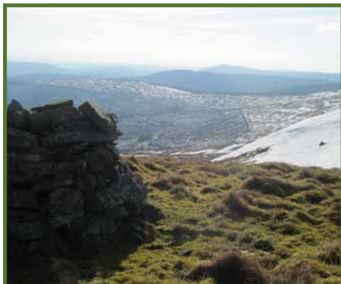
View towards Dumfries & Galloway

4. On leaving the summit, continue to follow the boundary fence north-west for approximately 300yds more, then leave the fence line and head due west to descend the ridge (in clear weather the line of descent is towards the summit of White Shank in the distance). Head down to the Entertrona Burn where you will pick up a good track that will lead down, over a bridge, to Over Phawhope Bothy and from there back to the start.