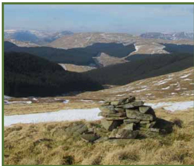
View of head of Ettrick Valley and beyond