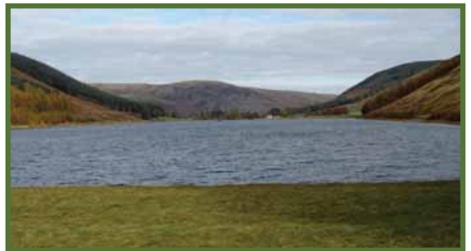
Loch of the Lowes