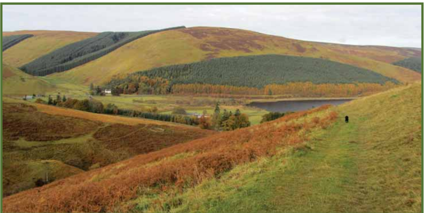
Path descending to Riskinhope and Loch of the Lowes