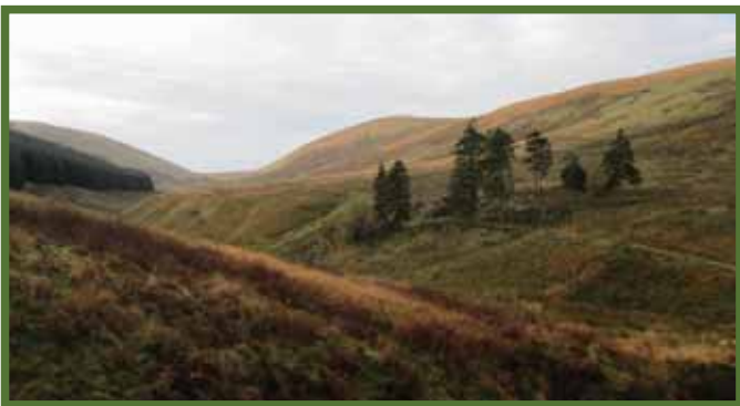
Path rises up to Pikestone Rig