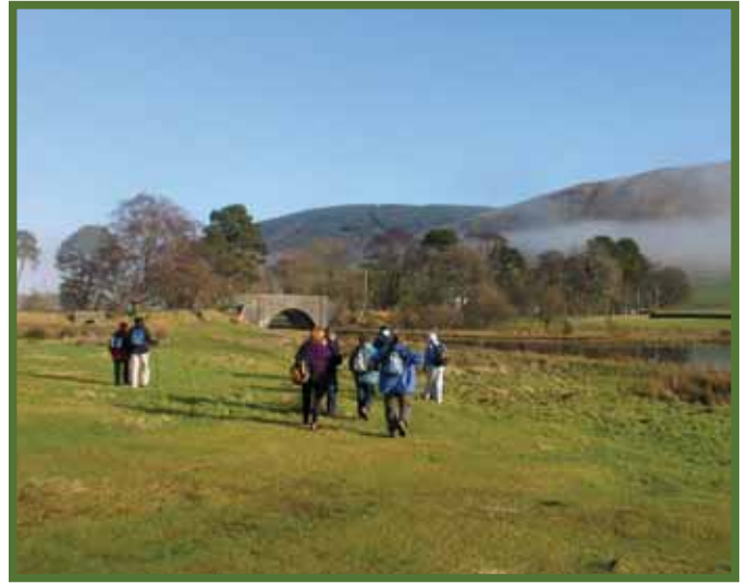
Starting from the Loch of the Lowes

4. From Riskinhope, turn right and follow the shore of the Loch of the Lowes back to the start.